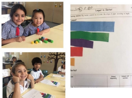
KY have been using the words 'longer' and 'shorter' to compare the lengths of different objects.