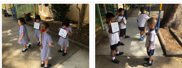
As part of our Science and Technology unit, 1H have been learning to write a code using numbers, words and pictures for their friends to follow.